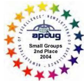
From left to right as above